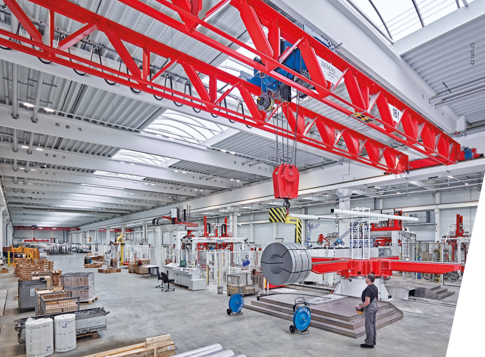
Six Demag V-type cranes transport the coils and sheets for further processing in the 175 m-long workshops.